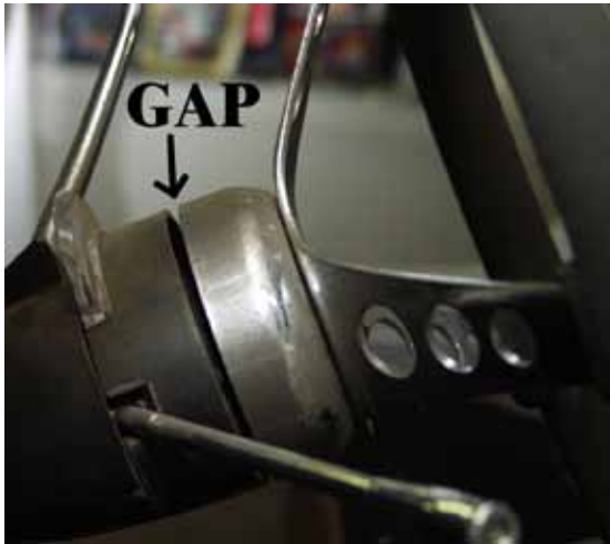
This photo shows the gap between the steering wheel hub and turn signal switch housing.