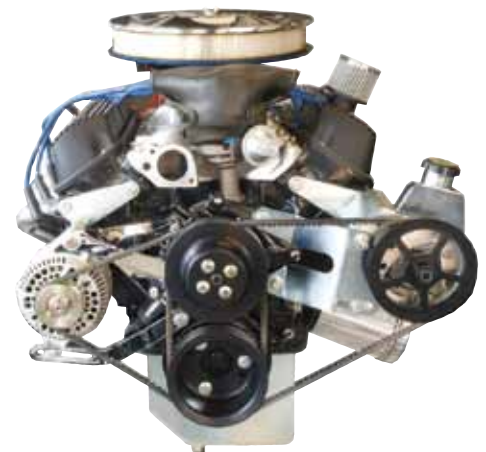
This photo shows front view of assembly on a 351W