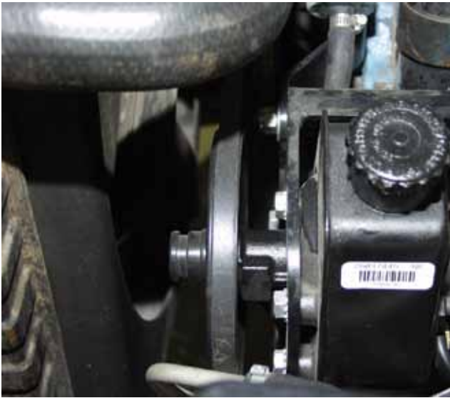
This photo shows view of the pump from passenger side.