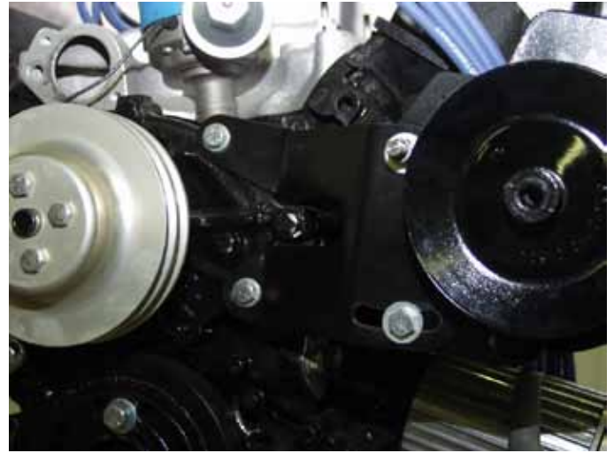
This photo shows the pump adjusting bracket and pump mounted to the water pump and head.