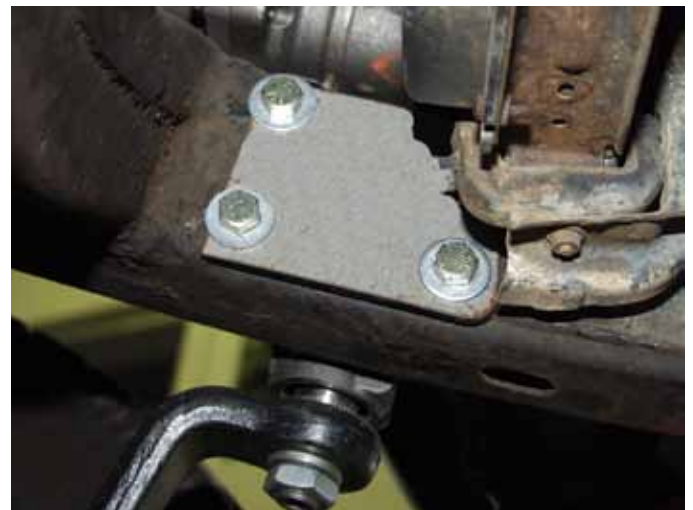
This photo shows a simple frame repair using a steel plate.