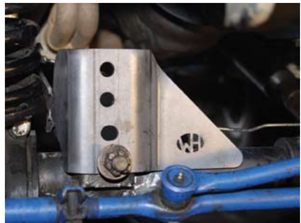
Using stock bolt to line up bracket for track bar positioning