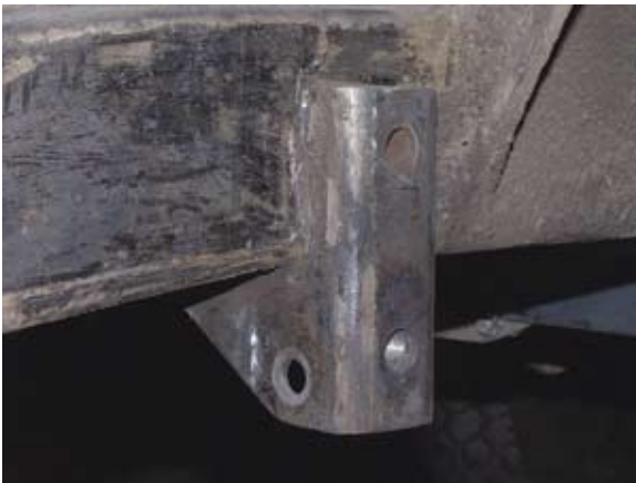
Stock 66-75 track bar drop bracket Do not cut off