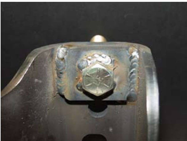
Welding support bracket and bolt